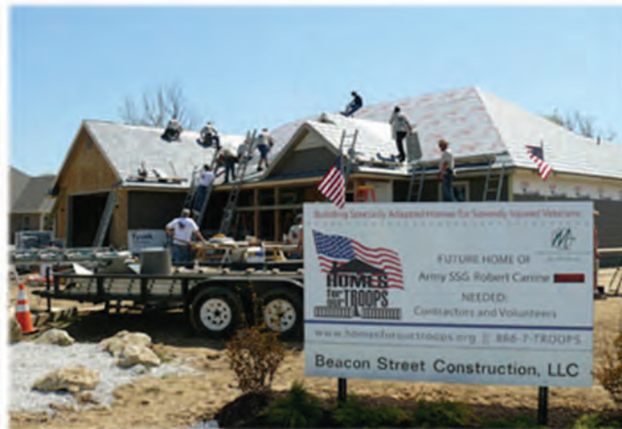
Construction has begun on SSG Canine's new home in Columbia, MO.

"Our employees and members have done a fantastic job of raising funds