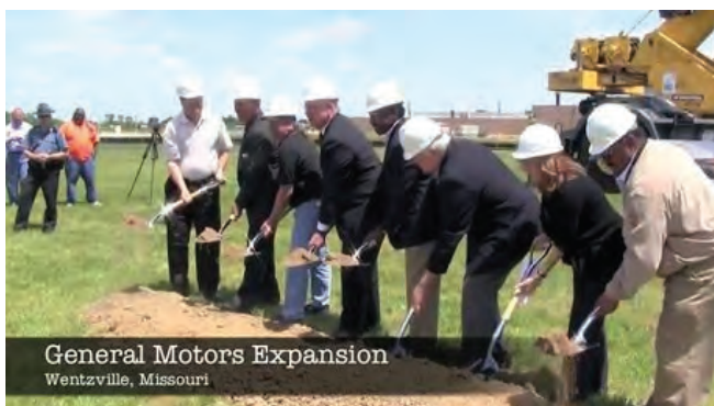
General Motors Expansion Wentzville, Missouri

We look forward to serving the financial needs of GM employees as we help them stretch their wage earnings as the economy and the St. Louis auto industry continue to recover.